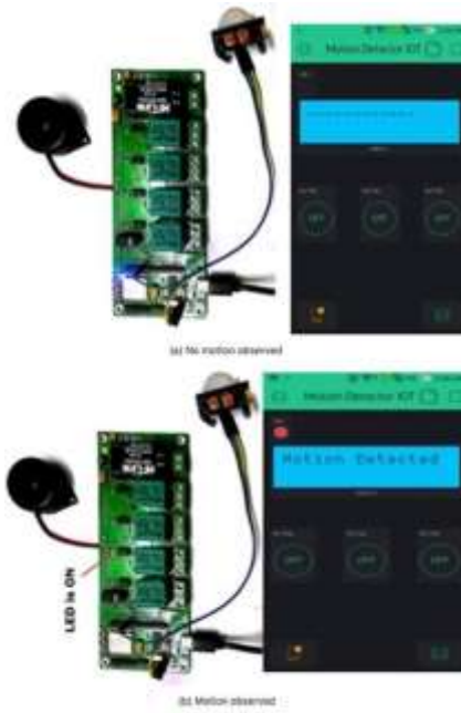
Fig. 3. SURE-H android app