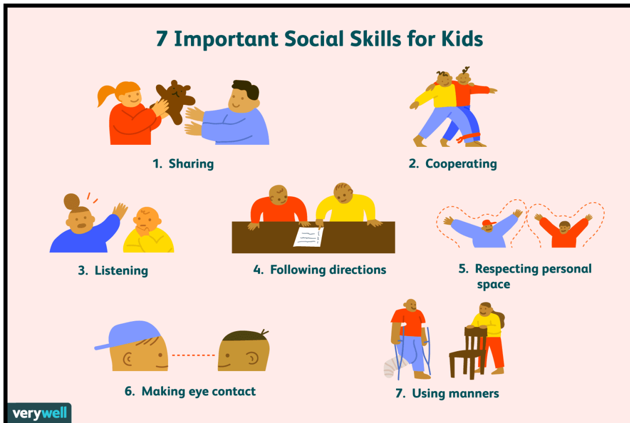
Figure 2: Informative children knowledge represented by animals' pictures