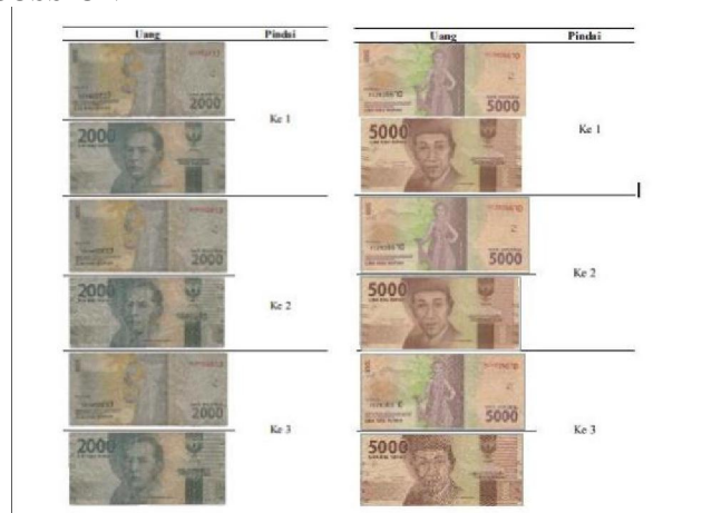
Figure 3. Result of scan banknotes