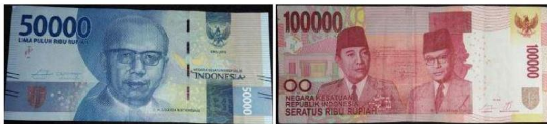
Figure 5. Data money.