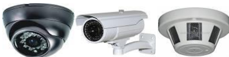
Figure 2: CCTV camera

An open-circuit system refers to a system that is targeted at an indefinite number of people, as in television broadcasts. Closed-circuit systems, on the other hand, are designed to provide video to specified viewers. One closed-circuit system that is primarily designed for surveillance purposes is generally called a closed-circuit television or CCTV system. CCTV is used in a wide variety of applications which include security, disaster prevention, energy and manpower saving, sales promotion and information services, production management, industrial measurement, medical care, education and military fields.