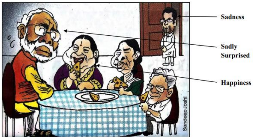
Political cartoon showing Two universal facial expressions and one compound expression