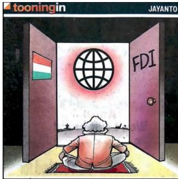
Political cartoon showing absence of facial expression