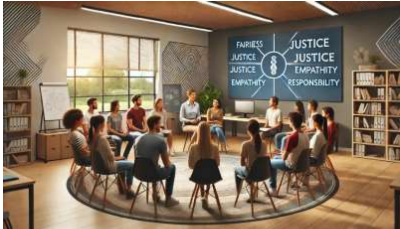
Figure 3: An Inclusive Classroom Demonstrating Ethical Principles in Education.

Applied ethics refers to the effort of finding answers to the most complicated ethical questions arising in normal practice, including decisions in the ordinary educational arena such as reactions toward cheating and balance between discipline and an inclusive learning environment (P. O. Okougbo, 2021). It gives the teacher practical tools in negotiating those dilemmas with a frame of ethics.