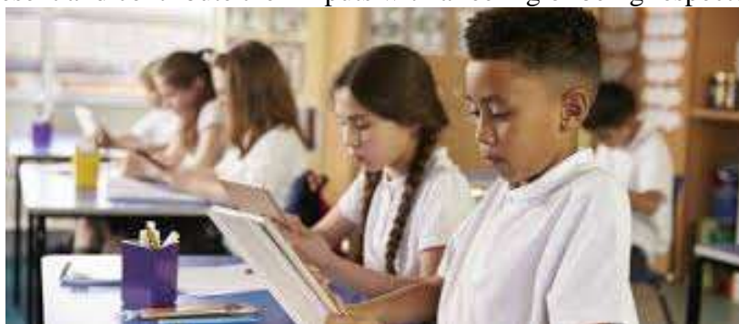
Figure 5: Promoting Equity in Classroom.

valued and enabled to completely participate in learning. It affirms and has respect for variation along cultural lines, socio-economic class, gender and learning disabilities (G. N. Uunona, 2023). Teachers are, therefore required to strive and create a setting that will have the students present and contribute their inputs with a feeling of being respected.