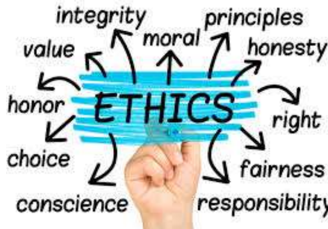
Figure 1: Ethics in Education.

The phrase "ethics in education" simply means, or refers to, the practice of moral rules and values directing actions, choice-making and interactions within schooling contexts. Such principles ensure an education process governed by ethical codes for fairness, integrity, respect and responsibility in teaching-learning relationships (T. Cerratto Pargman, 2021).