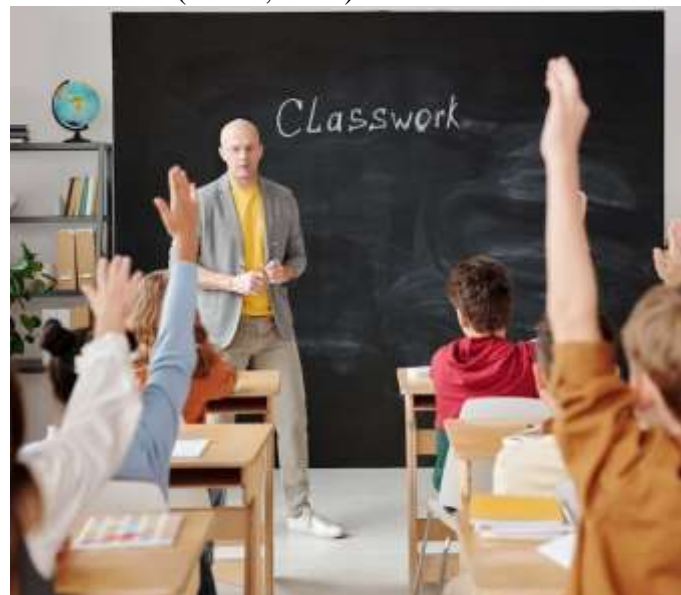
Figure 4: Ethics in Student's life.

The teacher-student relationship constitutes the core of the educational process and has ethical depth. Being built on the foundations of mutual trust, respect and mutual understanding, such a relationship modifies the learning context and affects both academic and personal growth of a student (Peters, 2024).